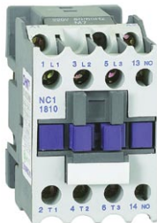
NC1 D09 01