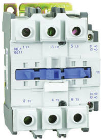
NC1 D50 11