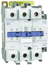
NC1 D95 11