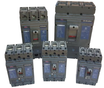
15 - 600A Frames

* Electrical equivalent with the same mounting holes & width. Verify faceplate and handle with each application. * Includes 6 (8 - 350 kcmil) wire lugs.