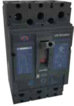
US Breaker HG

Square D HG 150 (HGL36100, HGL36125 & HGL36150) Powerpact & Merlin Gerin Compact (NS100, NS160, NSF150) Cross Reference