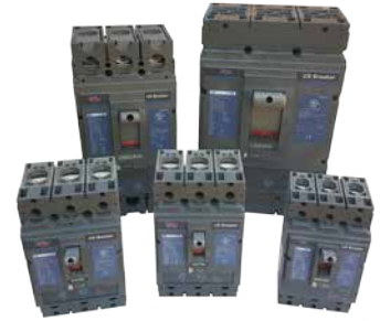
15 - 600A Frames

* Electrical equivalent with the same mounting holes & width. Verify faceplate and handle with each application. * Includes 6 (8 - 350 kcmil) wire lugs.