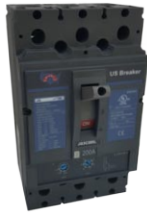
US Breaker JG