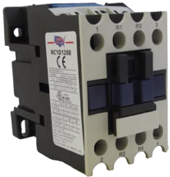
NC1 D12 08