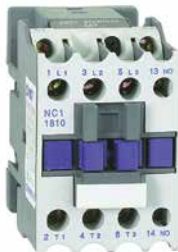
NC1 D18 01