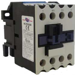
NC1 D25 08