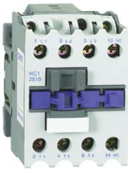
NC1 D32 01