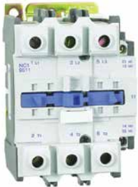
NC1 D65 11