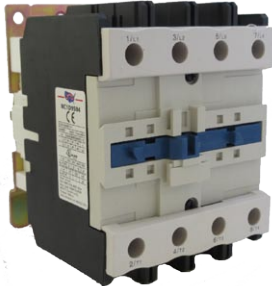
NC1 D95 04