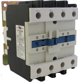
NC1 D95 04