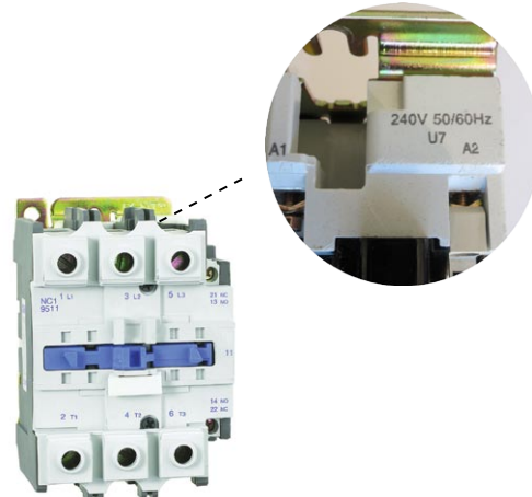
D40 to D95 Sizes