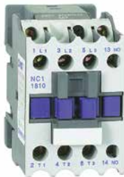
NC1 D09 01