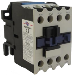
NC1 D25 04