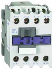
NC1 D25 01